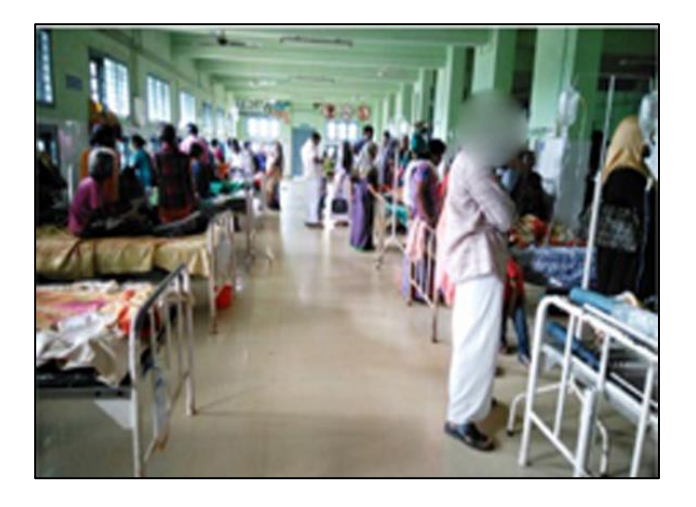
Figure 3: Crowded IP wards.

About 16 cases of respiratory infections were reported among health workers in last one year out of which 7 were pulmonary tuberculosis (TB) reported by staff nurses (Figure 1).